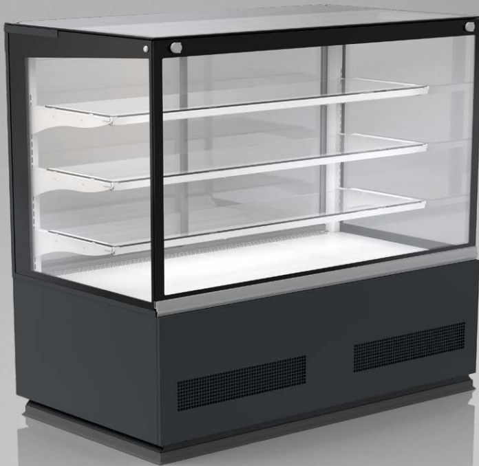
Elegant RDEL-21 1400 GDT